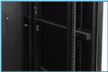
Vertical rail with U mark