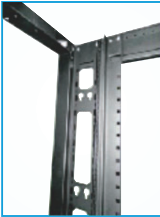
Cable management both side