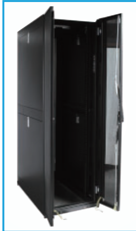
Rear Door-Double section