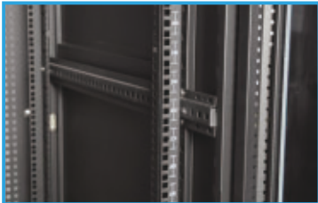
Vertical with U mark