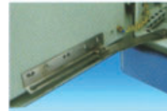
Limit position section