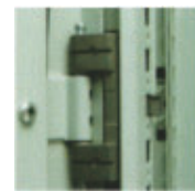
130 degree hinge