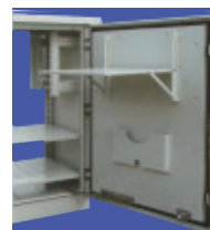
The door have computer panel and document bag