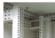
19 inch profile