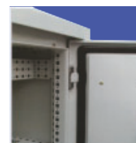
The frame have water resistant and PU gasket