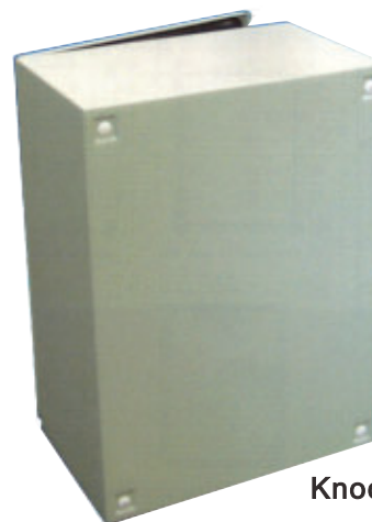
Knock-down door hinge