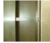
Zinc plated mounting angle and setting plate