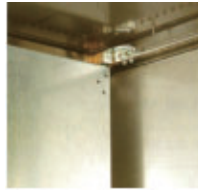
High IP degree