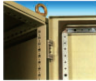
Removable bottom cover